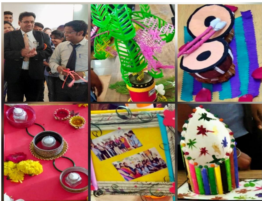
Recycle the present, Save the future