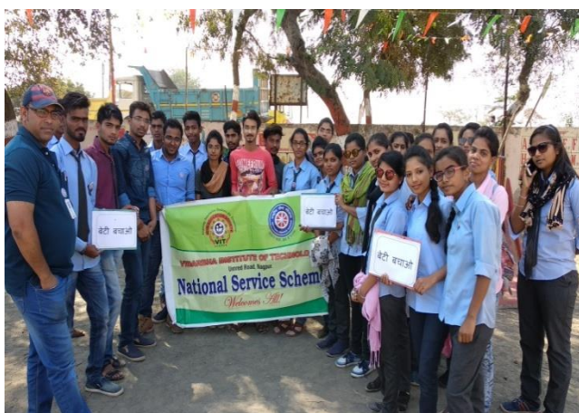
Beti Bachhao Morcha