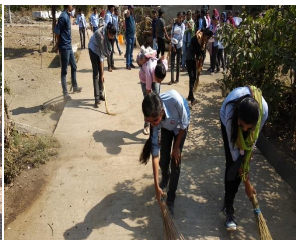
Gram Swachhtha Abhiyan