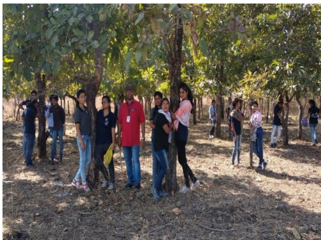
Jungle tracking & Students night out